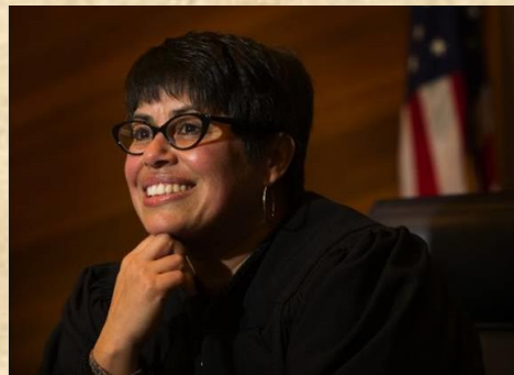
Judge Veronica Alicea-Galvan King County Superior Court